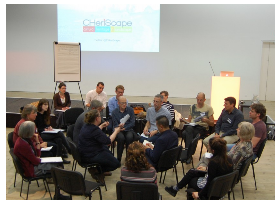
One of our ‘fishbowl’ type discussion sessions at the V conference, Newcastle upon Tyne, 14 June 2016

The conferences (and sessions we have organised at other conferences, including LAC 4 and PESCR 2016 to be held this summer) provide a rich vein of material to inspire the project's conclusions and inform the written outputs such as policy briefings, research strategies and academic papers which we will prepare in the coming month in the run-up to a high level event to mark the close of the current JPI ‘pilot call’ project. But the network we have built up through the conferences has clearly told us there is demand for CHeriScape to continue constructively beyond this.